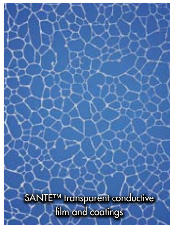
SANTE™ transparent conductive film and coatings