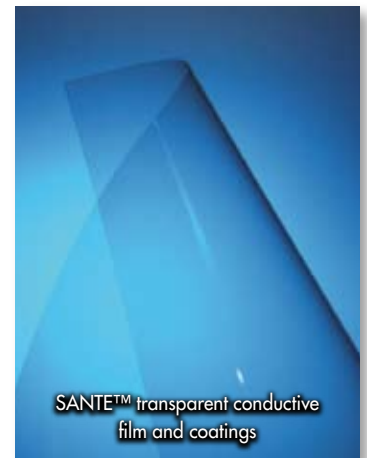
SANTE™ transparent conductive film and coatings

Recent Awards: Cima NanoTech is a winner of the 2008 World Economic Forum Technology Pioneer Award and Top Ten CleanTech Award. Cima NanoTech Israel was awarded funding in 2010 from the SIIRD Singapore Israel Industrial R&D Foundation.