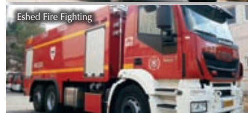
Eshed Fire Fighting