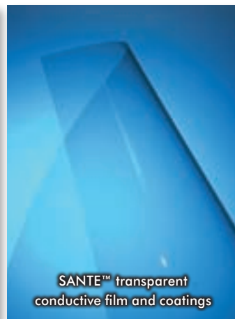
SANTE ™ transparent conductive film and coatings