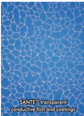
SANTE ™ transparent conductive film and coatings