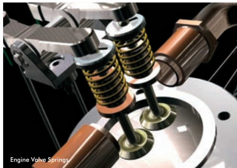
Engine Valve Springs

We provide complete solutions for a wide range of industries including automotive, cellular, irrigation, agriculture, telecom, medical,