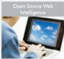
Open Source Web Intelligence