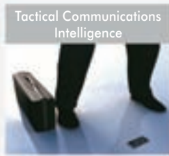
Tactical Communications Intelligence