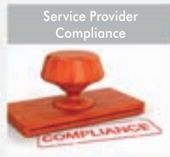
Service Provider Compliance

assist public sector organizations in detecting and thwarting cyber-attacks. Verint solutions efficiently collect, monitor, and analyze vast amounts of information from virtually any communication network or data source.